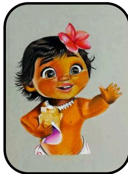
BY-MOHAMMED MUSHTHACQ E III BSC(COMPUTER SCIENCE) SEC-'B'